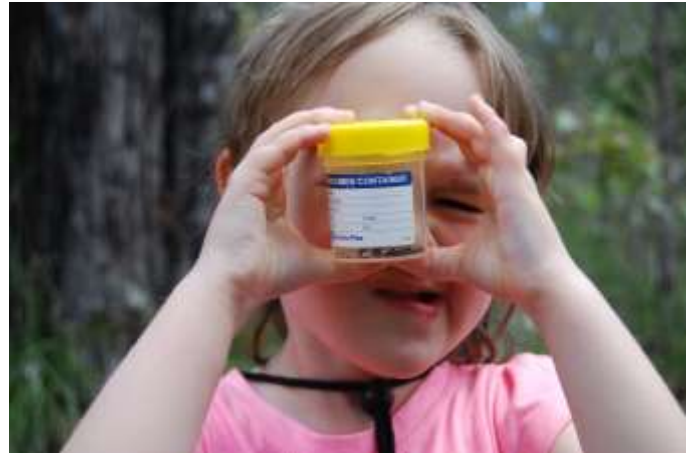
Edyn Hardy examining a bug collected at the open day

Once a delicious lunch, provided by local café Tasty Edibles, had been devoured, the group then collected bugs from an area of undisturbed forest. Specimens collected included a black and white striped spider, a particularly brightly coloured centipede, and a leaf-shaped cricket. All specimens collected were preserved and will be identified, measured, photographed, and entered into the Greenbushes Wetland Invertebrate Project database.