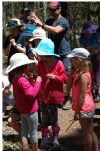
Children trying bush-tucker (left) and checking cockatoo nest boxes using a "camera on a stick" method (below left)