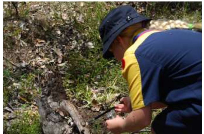
Collecting bugs from the undisturbed forest