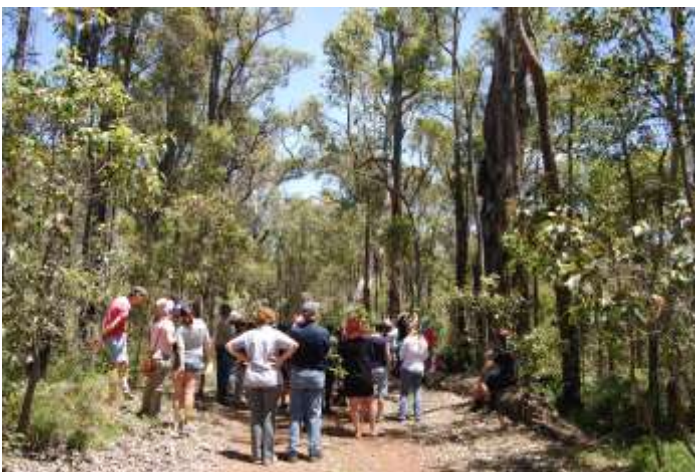
Monitoring Cockatoo nest-boxes using the 'camera on a stick'