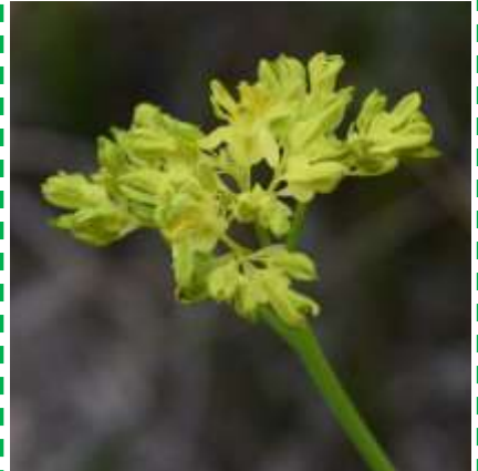
Glischrocaryon aureum "Common Pop Flower"

This is a hard-to-pronounce, intriguing, tufted perennial herb. This plant has conspicuous clusters of yellow flowers and grows from 15cms to 1m.