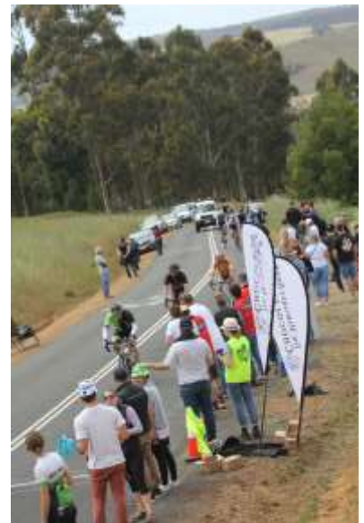
Spectators in the box seat for view