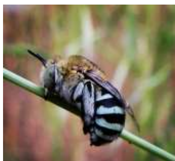
Native Blue Banded Bee