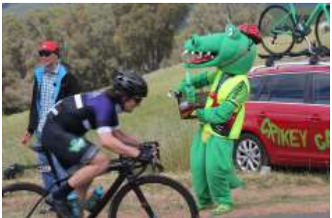
Crikey Cadel Croc cheers as riders go by