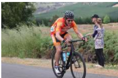
Riders pump up Kandalee Hill