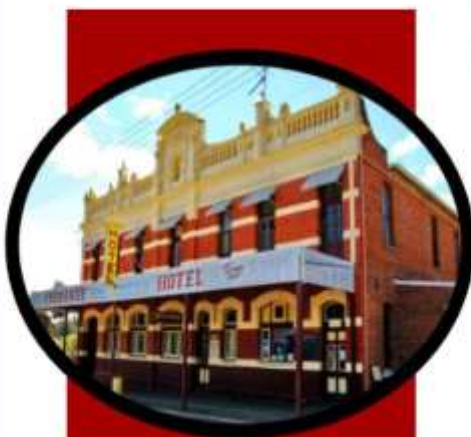
THE EXCHANGE HOTEL

9764 3575 or admin@greenbushescrc.net.au