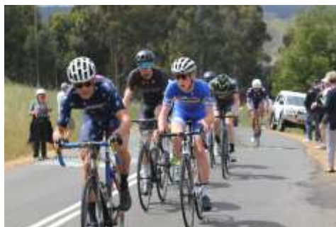
Riders pump up Kandalee Hill