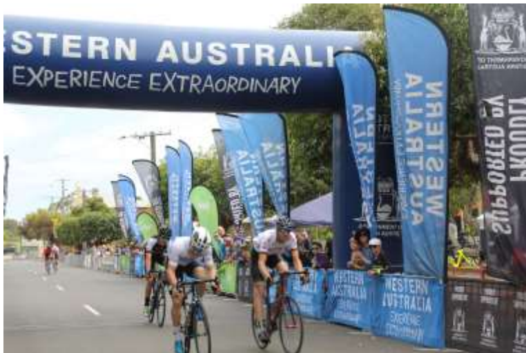
A big event in Greenbushes in November, the Tour of Margaret River drew more than 700 people into the centre of town.

Seven hundred and fifty cyclists, support crews and spectators streamed into Greenbushes on November 10 for the 2018 Tour of Margaret River Cycle Race.