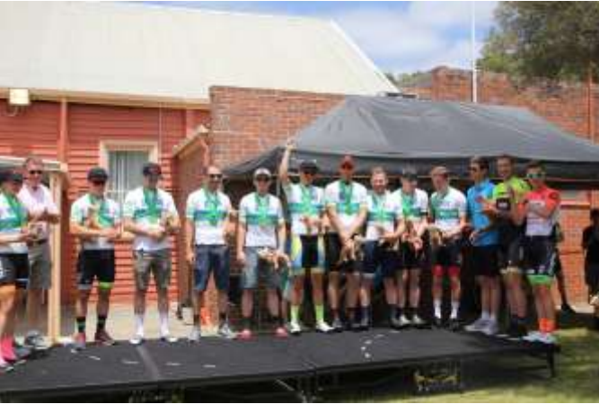
Talison Lithium Jersey winners on the podium at Thomson Park during the presentation ceremony.