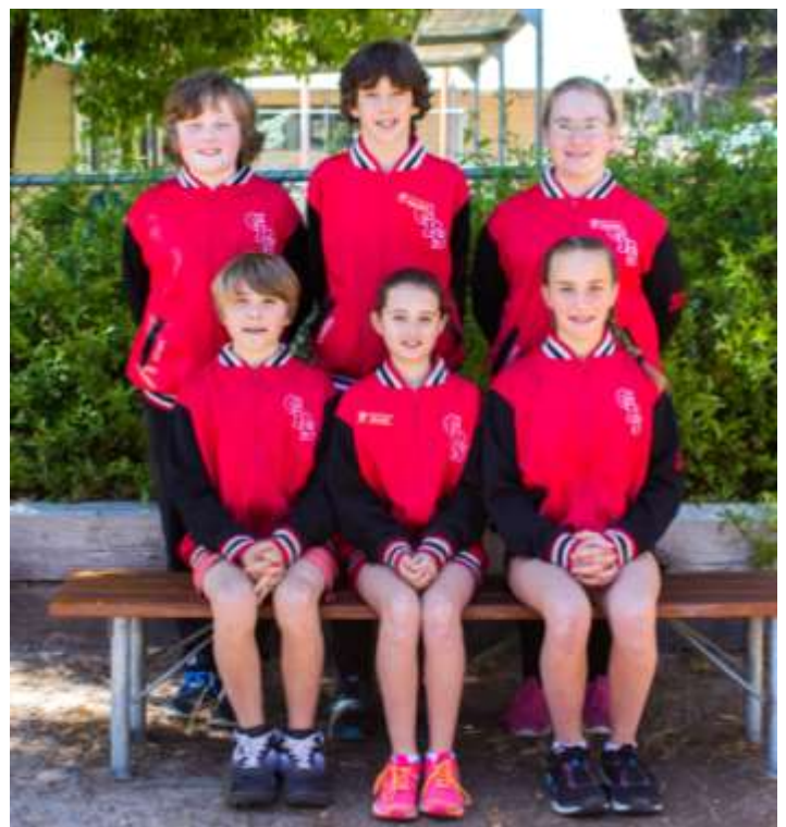
Senior Class at Greenbushes.