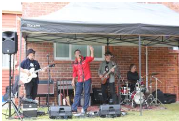
Talison and Blues of Bridgetown collaborated to provide the fabulous Two Dollar dog band for the Thomson Park picnic area during the morning.

Organisers are hoping the Tour of Margaret River event can be run again in town next year.