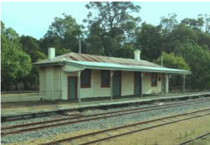
North Greenbushes Railway Station today

Previously, an emu had paused on a driveway to watch me drive by, and a mob of kangaroos on a front paddock had briefly stopped grazing to ensure that I was more interested in the railway than I was in them. North Greenbushes: just another day. But a lot has happened to get the North Greenbushes settlement to 2018.