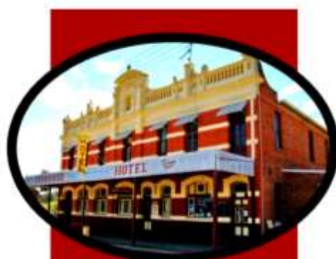
THE EXCHANGE HOTEL