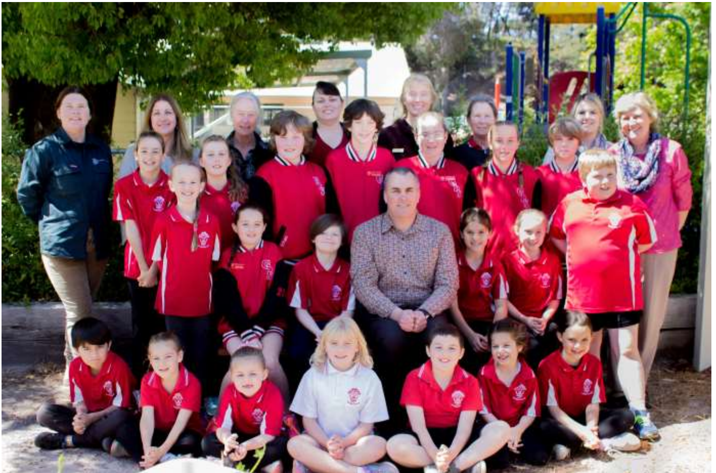
The Students and Staff of Greenbushes Primary School 2018.