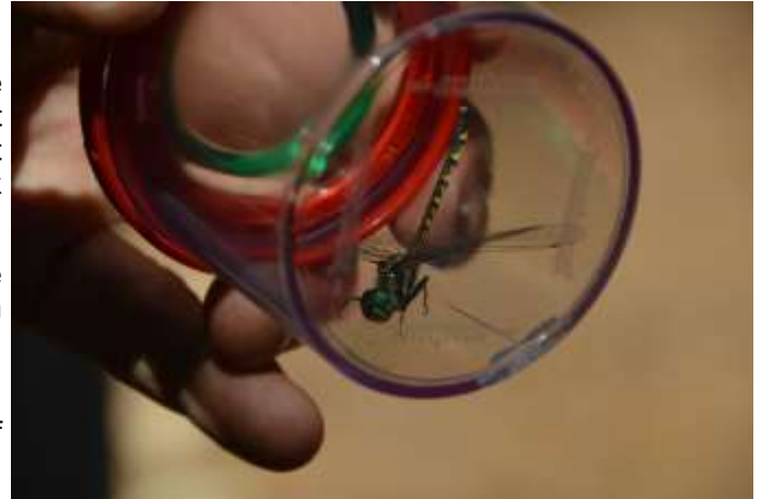
The green eyes and orange yellow colouring of the Australian Emerald Dragonfly ( Hemicordulia australiae ) is beautiful to behold.

The dragonflies this year have been especially showy, some even following us almost like they're showing off their colours.