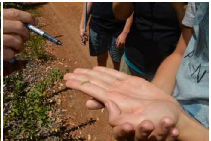
Carrying out water studies at Greenbushes with the dense reed vegetation providing a biological filter for the waterways (above left) Get up close and personal with a few bugs— join our team on Tuesdays at the Greenbushes Community Garden from 9am.

TUESDAY IS GREENBUSHES PROJECTS DAY—CALL INTO THE COMMUNITY GARDEN ON TUESDAYS FROM 9:00am TO HELP OUT. THE MORE HELPERS THE BETTER.