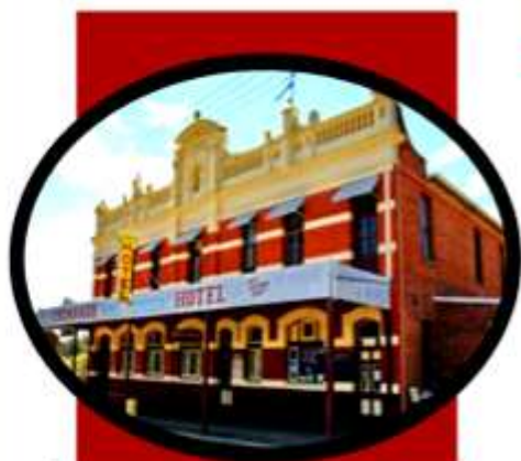
THE EXCHANGE HOTEL