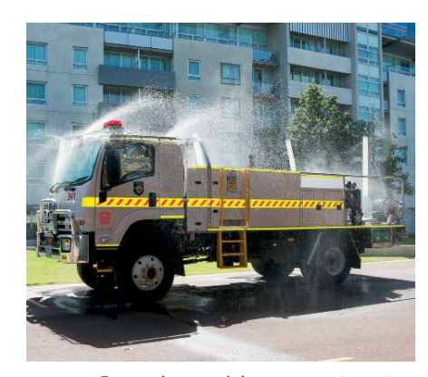
External water deluge system in action

The $15.4 million project includes a $12.3 million investment over three years through the State Government's Royalties for Regions program to provide crew protection equipment on 667 appliances in regional Western Australia. Altogether the crew protection equipment will be installed on nearly 1,000 DFES and Local