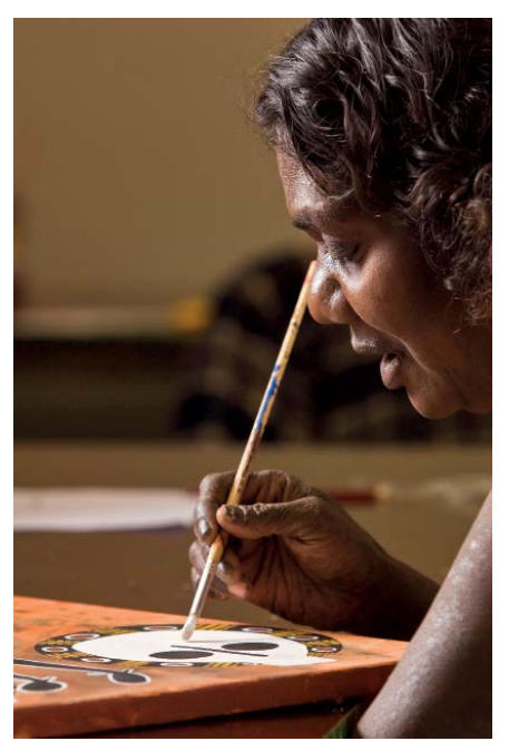
Aboriginal Artist in the Kimberley

"I look forward to seeing these 17 businesses contribute to the improved quality and authenticity of Aboriginal tourism products."