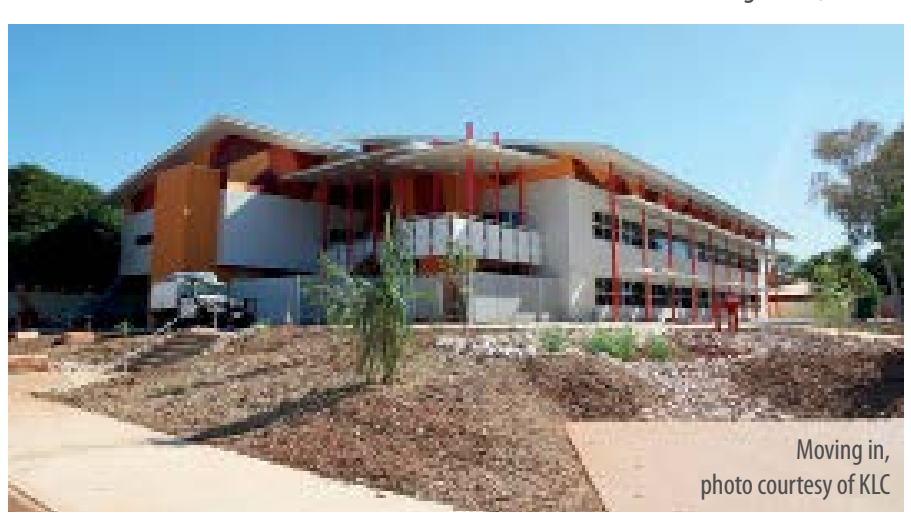
Continued on page 2

First established in 1978, the KLC is the peak Indigenous body in the Kimberley region, working with Aboriginal people to secure native title recognition,