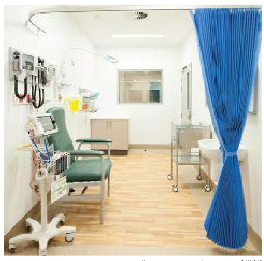
New treatment room, photo courtesy of WACHS

The two state-of-the-art resuscitation bays are equipped