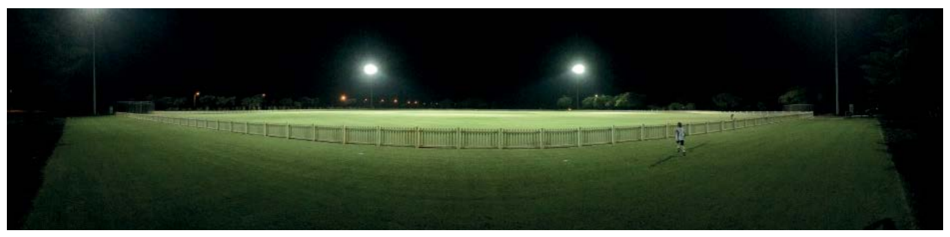
Barnard Park by night

To access more information and keep up to date on the progress of the Busselton Foreshore Redevelopment project, visit www.busselton.wa.gov.au