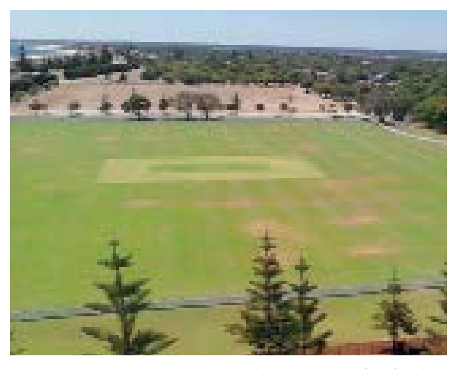
Barnard Park aerial, photo courtesy of City of Busselton

"Our main aim was to lock down a prime location for a unique sporting field for the community to enjoy now and into the future, and we definitely succeeded.