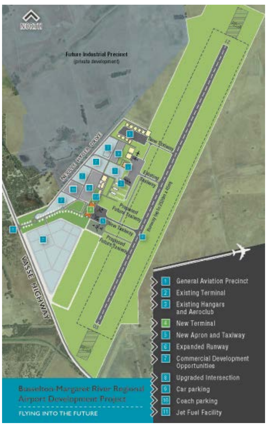
Busselton-Margaret River Regional Airport Masterplan, image courtesy of City of Busselton

Expansion of the Busselton-Margaret River Regional Airport began in 2015 and will be completed in 2018.