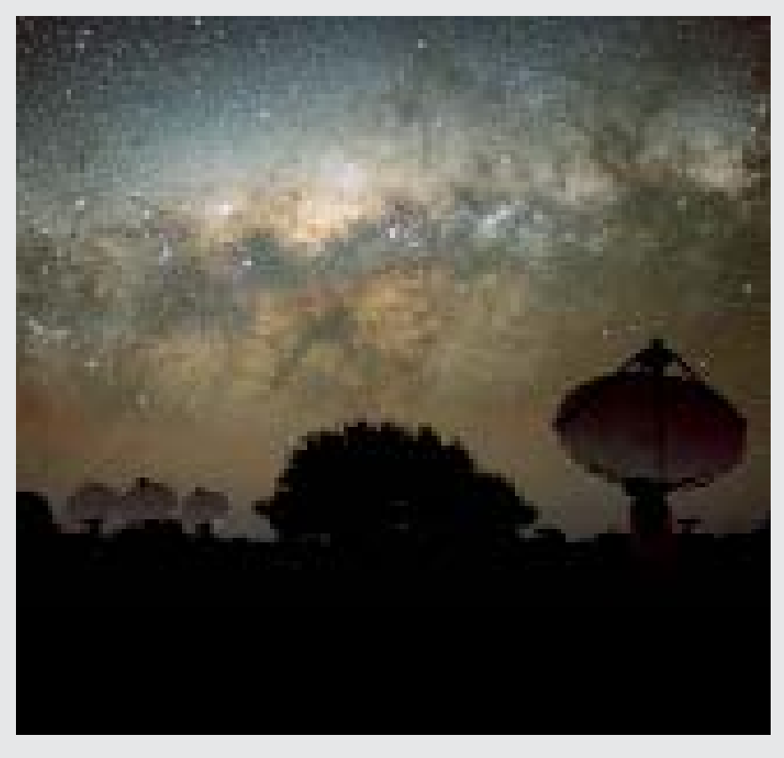
ASKAP dishes silhouetted against the Milky Way

For more information on the SKA project visit www.ska.gov.au