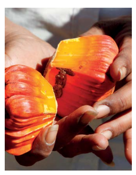
Pandanas fruit found in northern Australia, photo courtesy of WAITOC