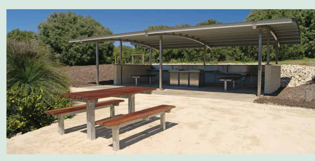
Barbecue shelter in Conto

Logue Brook recorded more than 47,000 visits in 2014-15 and is located about 10 minutes away from the town of Harvey.