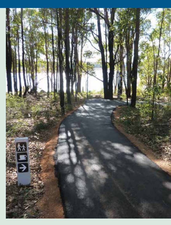
Mountain bike pump track in Logue Brook, photo courtesy of Department of Parks and Wildlife

approximately $575,000 was leveraged to complete the project. An amount of $600,000 was invested for East Bowes Road through the Mid West Investment Plan administered by the Mid West Development Commission, with an additional amount of approximately $2.28 million leveraged from other Royalties for Regions, Commonwealth and Shire funding programs.