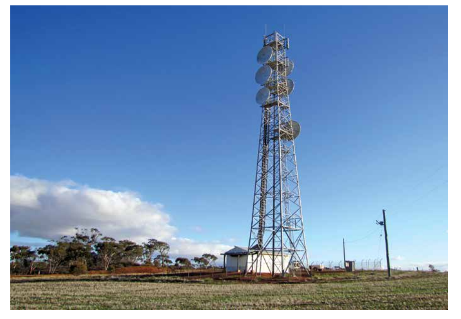
Tammin mobile tower

Due to the success of the Regional Mobile Communications Project, a further $45 million has been invested to install another 85 telecommunications towers in small communities as part of the Regional Telecommunications Project.