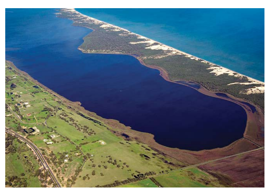
Leschenault estuary

Thanks to Royalties for Regions, the initiative will implement estuary health and management improvements at Peel-Harvey, Leschenault, Hardy Inlet, Wilson Inlet, Oyster Harbour and Vasse Geographe estuaries. For more information, visit www.water.wa.gov.au