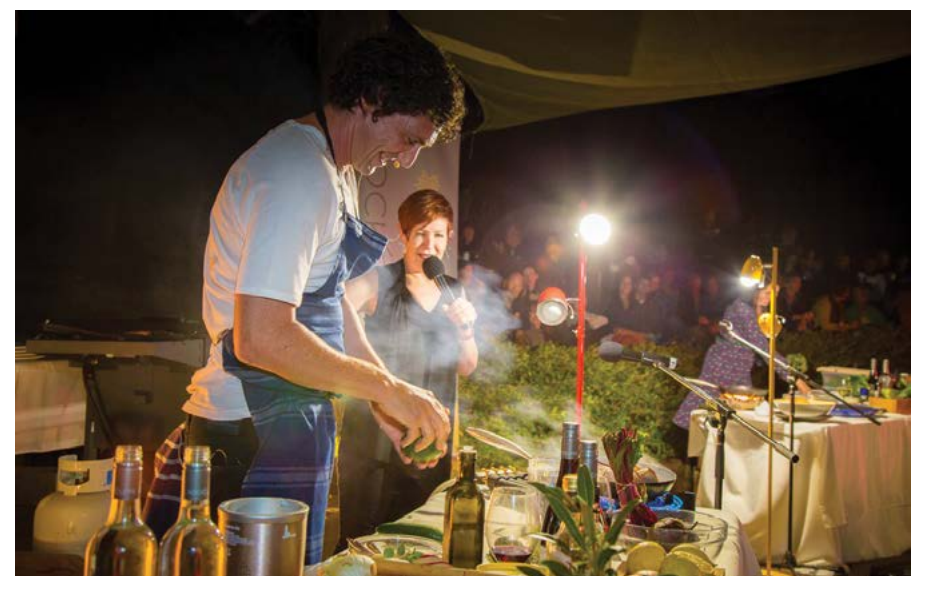
Celebrity Chef Colin Fassnidge cooks up a storm at the Rockcliffe Night Market

Held on Thursday 24 March, the picnic saw participants embark on a scenic helicopter flight to Breaksea Island where they tasted some of the region's finest beer, wine, and canapes, prepared with a focus on native Australian ingredients.