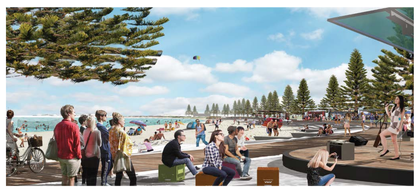
Artist impression of Koombana Bay

Royalties for Regions, through the Growing Our South initiative, will invest $600 million to revitalise the South West, Peel, Wheatbelt and Great Southern regions. For more information, visit www.swdc.wa.gov.au