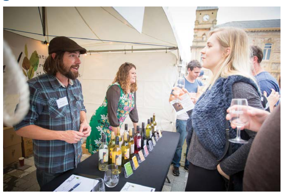
Talking food and wine at the Albany Seafood Night Markets

For more information on funding for regional events, visit www.tourism.wa.gov.au