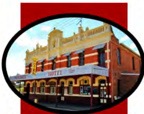
THE EXCHANGE HOTEL

See the article inside this edition of the Greenbushes Balingup Newsletter to find out more.