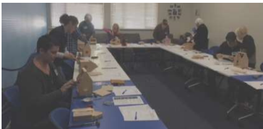
Participants from Greenbushes, Bridgetown, Balingup & Donnybrook busy constructing their birdhouses.

Watch this space for more wood work workshops.