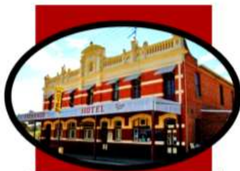
THE EXCHANGE HOTEL