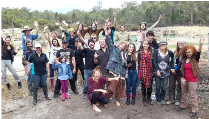
Acti-vate Volunteers planting at Charnley's Dam

The Priority Bittern and Waterbird Biodiversity Enhancement Project , coordinated by the Blackwood Basin Group (BBG), has continued to make progress with lots of action at the site.