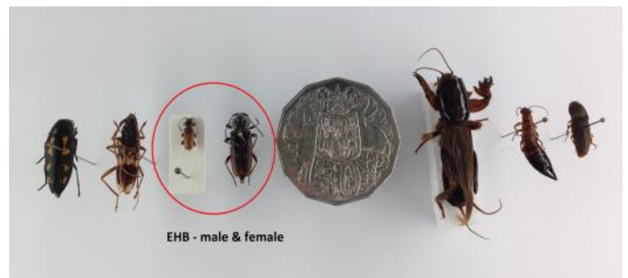
EHB - male & female

Public awareness is crucial in stopping the spread of EHB. People are asked to regularly inspect untreated pine and when building in Restricted Movement Zones people must use treated pine or other material not susceptible to EHB. Always dispose of unwanted pine timber via green council bins not road rubbish collections.