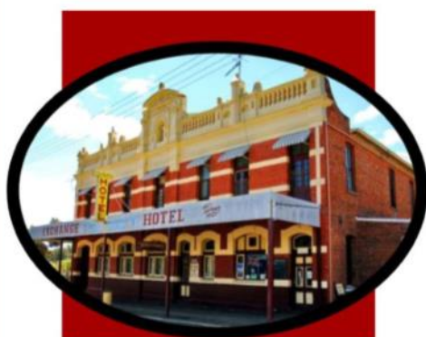
THE EXCHANGE HOTEL

CLOSING DATE OF ALL BOOKINGS AND ENQUIRIES ARE 18TH JUNE 2015