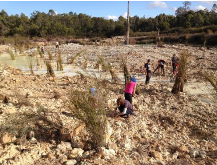
Acti-vate Volunteers planting at Charnley's Dam