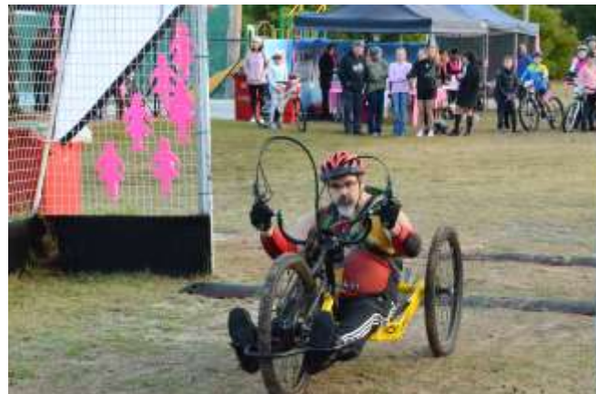
Wheels are no barrier in the family friendly event as there is a category for all.