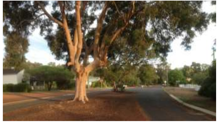
Jephson with its double width plus median strip