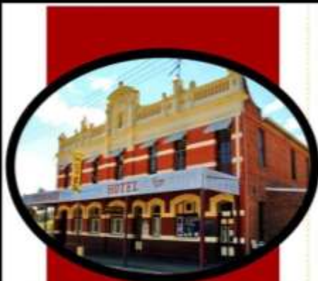
THE EXCHANGE HOTEL