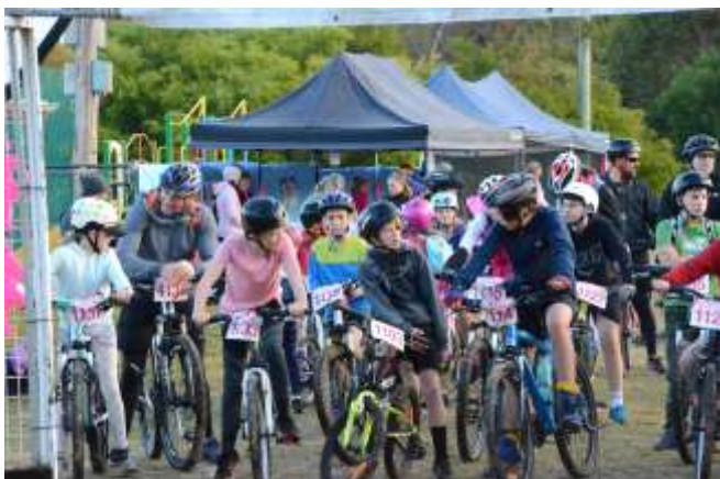
Cyclists set off in the bike event at the Fun Run which is growing in popularity each year.