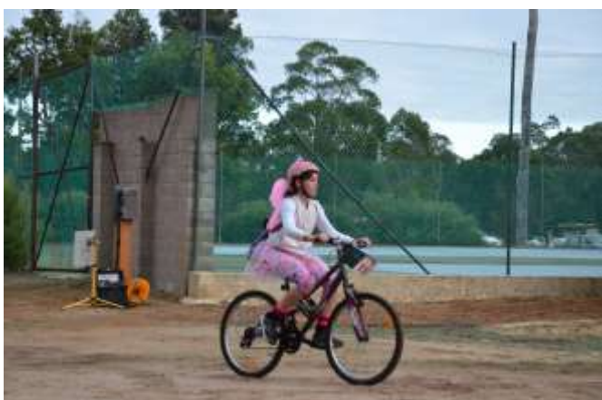
Flying to the finish line in the mountain bike event.