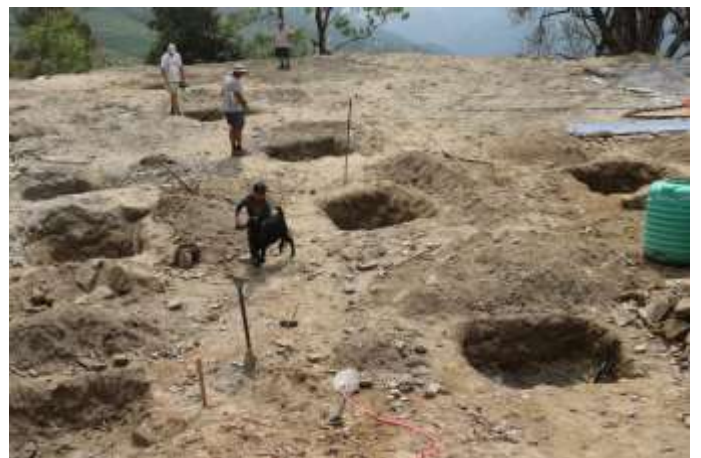
Very manual labour was the order of the day—so we slept well each night.