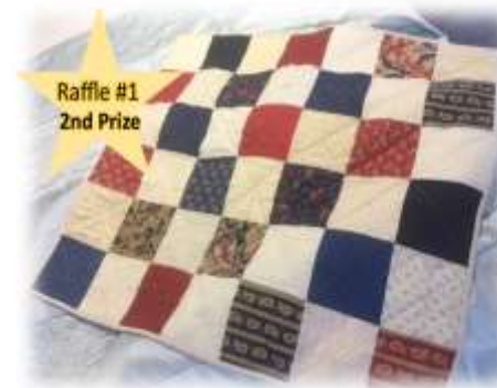
Raffle #1 2nd Prize