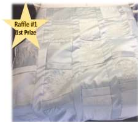
Raffle #1 1st Prize