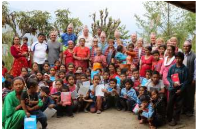
The people on the journey were so friendly and happy.

After an 8 hour trip to Chitwan National Park... covering 185km and passing truck after truck bringing goods, food and materials into Nepal from India we were able to relax in a safari lodge on the edge of the Rapti River serviced by country people and at a very much slower pace. We did a number of walks and jeep drives into the National park to see the numerous unique birds, one horned rhinos, hog and spotted deer, wild boar, monkeys, sloth bears and crocodiles.