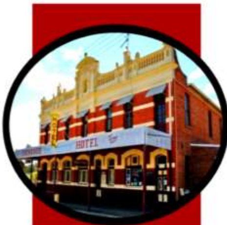
THE EXCHANGE HOTEL