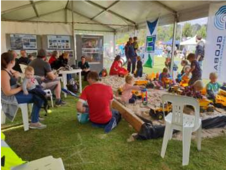
Families enjoy the giant sandpit in the Talison/Global Advanced Metals marquee at the Balingup Field Day.

With water shedding off higher ground adding to the rain, the oval quickly became a quagmire. While most patrons had left before the height of the storm, exhibitors still had to unpack, moving vehicles (and in some cases animals) on and off the site.