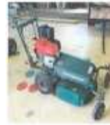
H25 has 26 inch cut

Phone: 0437495554 bridgetowntowing@gmail.com