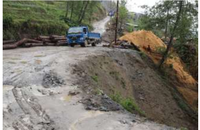
Roads and infrastructure in Nepal are still chaotic as the region is still reeling from earthquake damage suffered in 2015. Most roads we travelled on were damaged.

Traffic is absolutely chaotic but does keep moving very slowly and with 1.4 Million people (size of Perth) and the 3 rd world environmental standards there is a lot of pollution and smells. Notwithstanding that the various temples and squares were interesting, colourful and the history complex and intriguing.