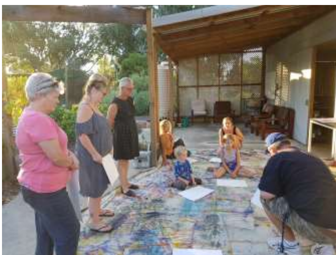
Learning the techniques for graffiti art at the workshops