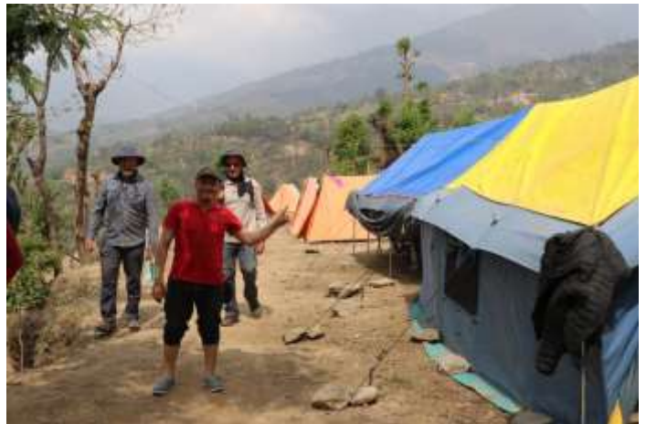
We were housed in wilderness tents sleeping on a couple of gym mats but the view was awesome.