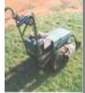
Y560 has 22 inch cut

Slashers for Hire Is your lawn mower not doing the job? Self-propelled, Tough and easy to use!