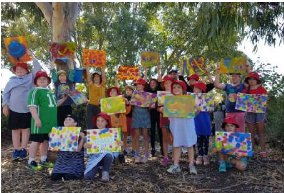
Students from Greenbushes Primary School learnt new skills and participated in the Greenbushes Community Garden's Mural Project.