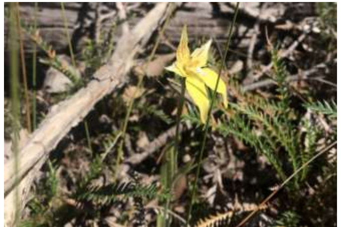
Pictured below is Margaret's favourite—the Dragonfly larvae.

The plant group had the enviable job of spending their day out in the dappled shade right at the start of the best part of flowering season. This photo of the Cowslip Orchid shows there were plenty of beautiful wild-flowers to see at the Bioblitz.