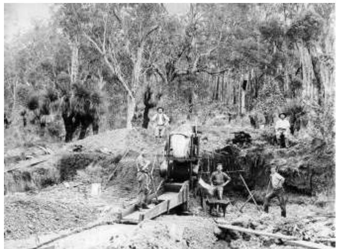
An early photograph from the Greenbushes Tinfields featuring miner Frank Winfield seated top right and below are miners sluicing for alluvial tin at Greenbushes.