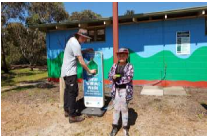
The Greenbushes Tidy Towns Portable Filtered Water Station was a welcome facility at the Pool for the Bioblitz.

Please contact the Blackwood Basin Group on 97651555 to put your name down to receive a report when it is finished.