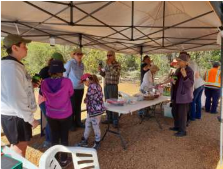
Delicious food was provided by the Greenbushes CWA Belles.

The day was made perfect by regular stops back at HQ at the Greenbushes Pool where the CWA Greenbushes Belles supplied an abundance of the most delicious food. The type of food where you can't stop eating just for the taste and it never runs out. There were enough leftovers for dinner and everyone still had little doggy bags to take home after.