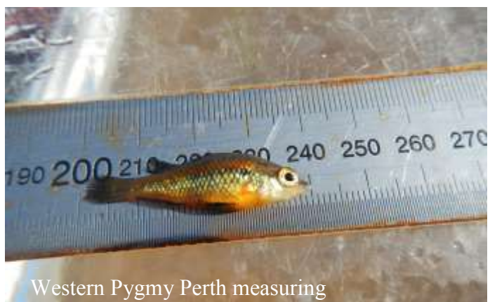
Western Pygmy Perth measuring

The bad news is the abundance of Eastern Gambusia. This aggressive North American fish species was introduced to WA as a way to control mosquito numbers, even though native species do a better job of this. Eastern Gambusia attack the fins of native fish and compete against them for food and territory. The theory on why the native fish are doing so well, despite this pest's presence, is the large beds of macro-algae along with the rushes that form part of our revegetation program which provide terrific hiding places for the natives.