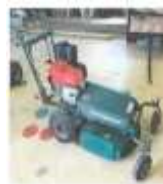
H25 has 26 inch cut

Phone: 0437495554 bridgetowntowing@gmail.com