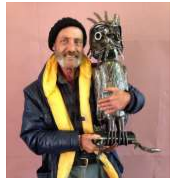
Winning bidder for the Wise Owl Metal sculpture.