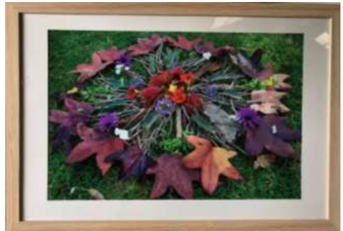
Room 1 at Greenbushes Primary School took out the Schools' Category with this photograph.

Leanne Green : Chairperson Grow Greenbushes