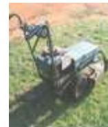
Y560 has 22 inch cut

Slashers for Hire Is your lawn mower not doing the job? Self-propelled, Tough and easy to use!