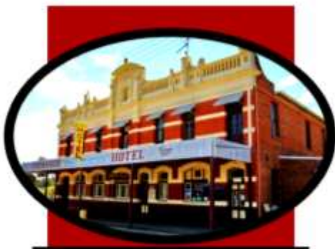
THE EXCHANGE HOTEL

10am to 12pm - $5 per session - Lunch available for $9