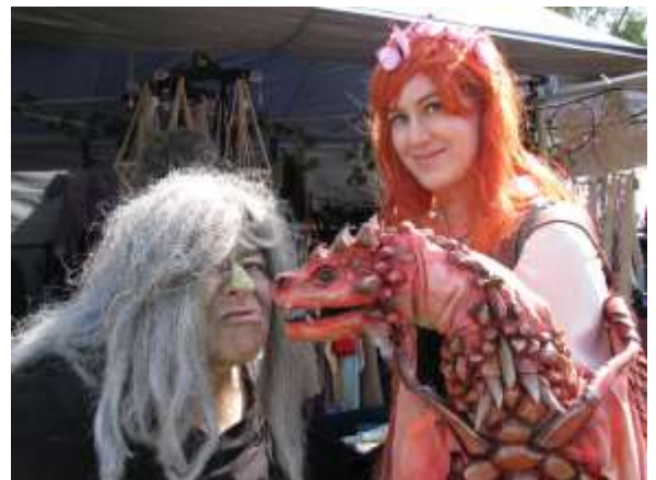
Beauty and the beast at Balingup in August.

There were 120 volunteers behind the scenes working to ensure the event was a success. This year the organisers also had help from volunteers from Bunbury Regional Prison's Pre-Release Team. See inside this edition for more photos.