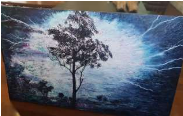
Vikki Cook's Tree in a Storm won the main prize.

The Greenbushes Art Trail and Exhibition inspired a range of fabulous works exploring the theme of "energy."