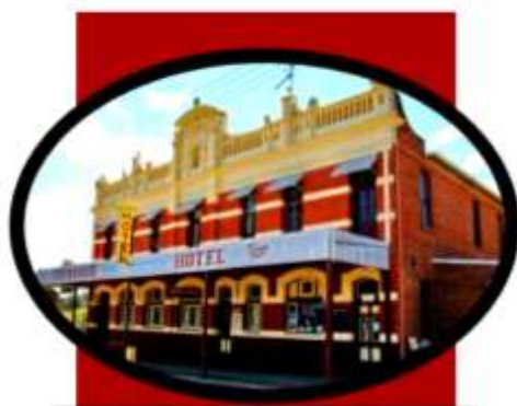
THE EXCHANGE HOTEL