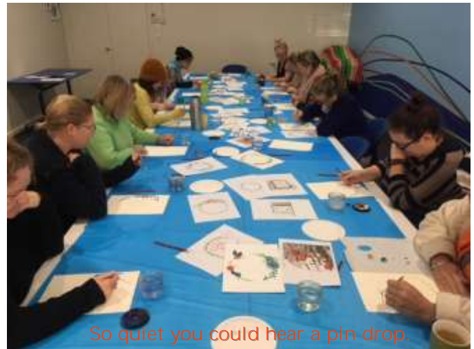
So quiet you could hear a pin drop.