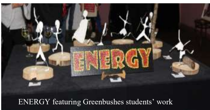
ENERGY featuring Greenbushes students' work