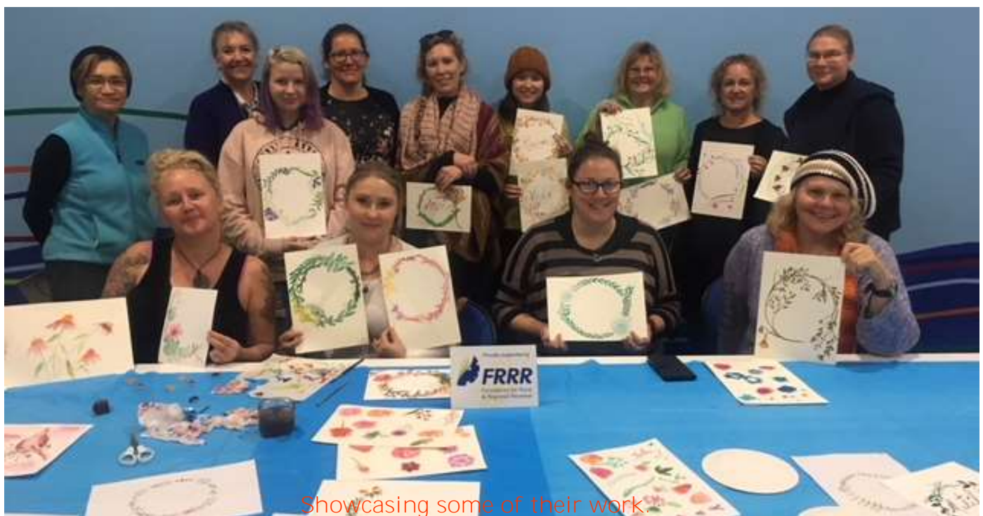
Showcasing some of their work.